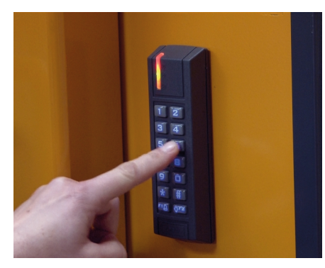
Control who operates your baler with a digital auto lock.