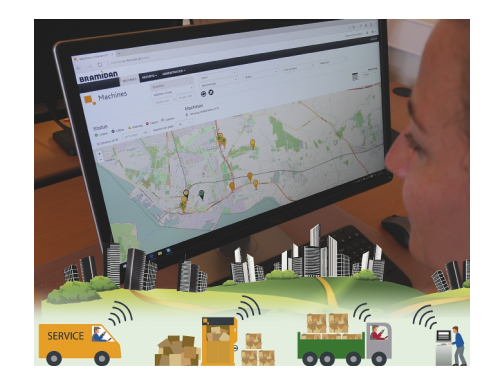
Get online access to your balers with our monitoring system called BRA-IN.