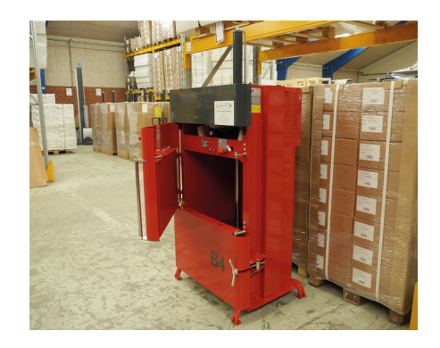
You may choose other RAL colours for your balers.