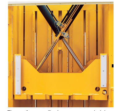
The scissor cylinders ensure stable compression and a low overall height.