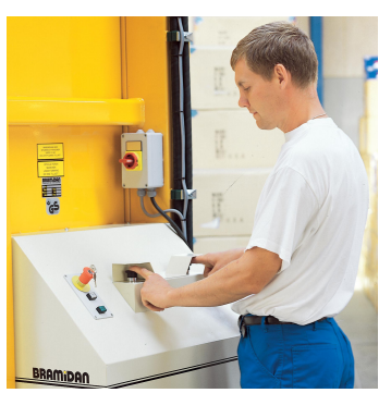
The bale is ejected by a safe two-hand operation.