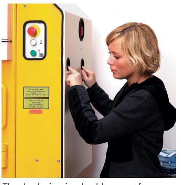
The bale is ejected by a safe two-hand operation.