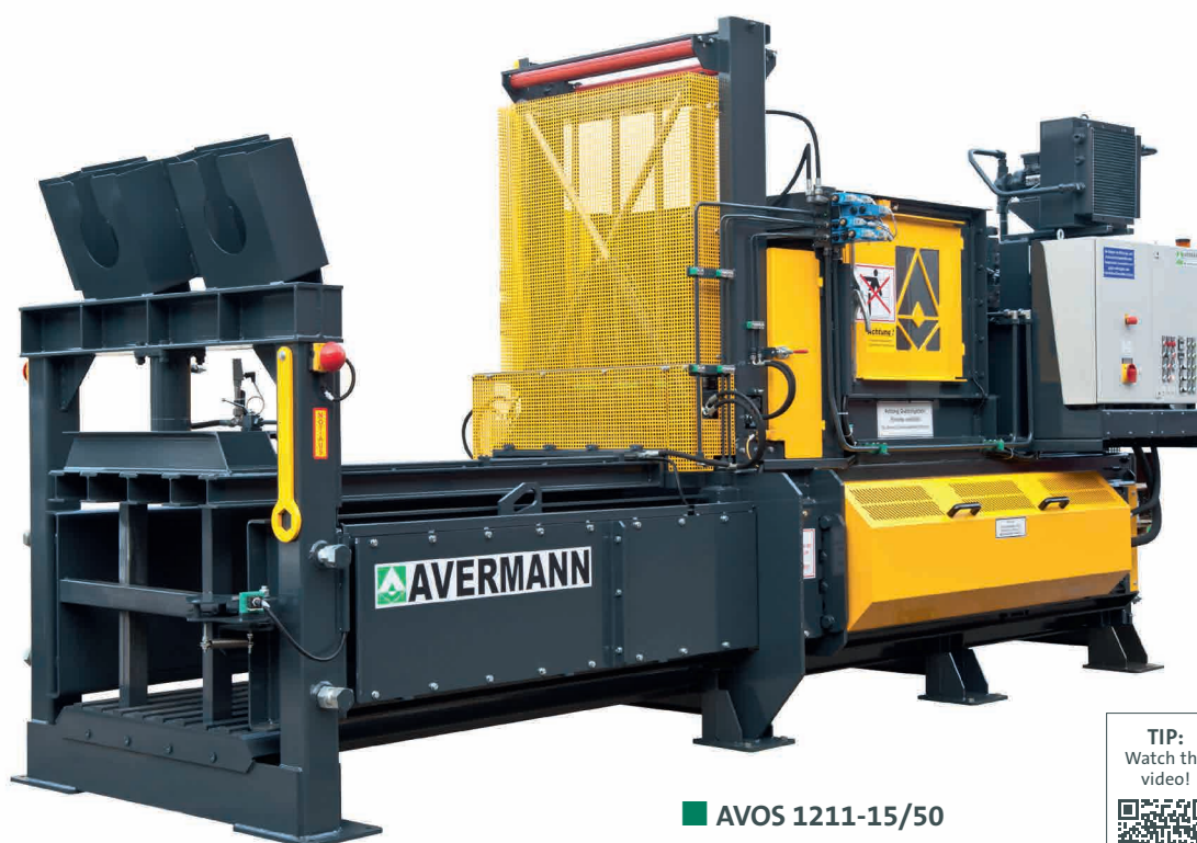
■ AVOS 1211-15/50