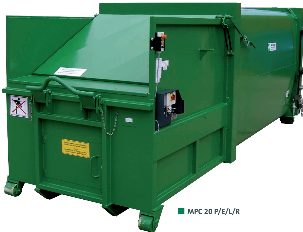
■ MPC 20 P/E/L/R