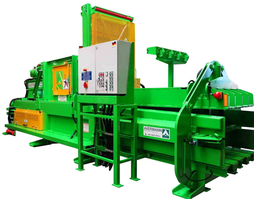
■ AVOS 1410 RH-22/50